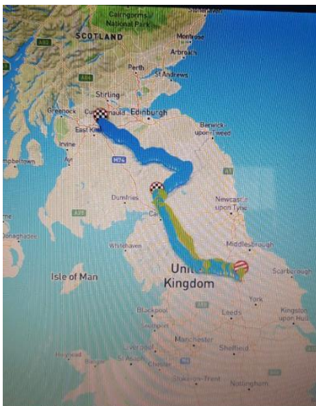
GPS tracker showing route taken by pigeons this week