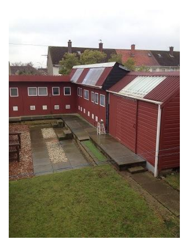
Sharp Cummings Durning are having a cracking season winning another 1st in Coatbridge SC Sharp Cummings Durning fine loft set up